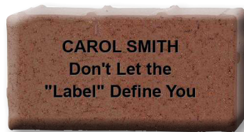
4x8 Sample Brick