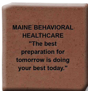
8x8 Sample Brick